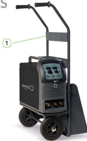
① T 1 trolley

QUALITY AND PERFORMANCE - WITHOUT COMPROMISE